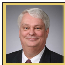
TOMMY ICE PRE-TRIB RESEARCH CENTER